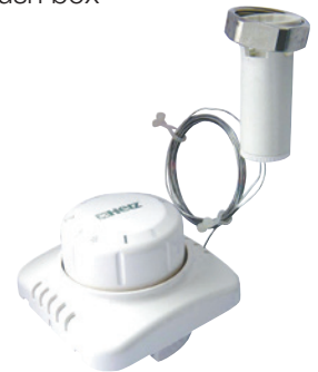
HERZ-Thermostat with remote adjustment